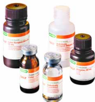
Quantase Neonatal GALT Assay Kit

Bio-Rad Quantase™ offers a complete package for galactosemia testing. Whether screening with Total Galactose or with GALT (transferase), Bio-Rad provides results you can have confidence in.